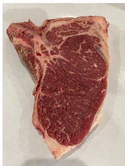
T Bone steak from Fail Safe steer